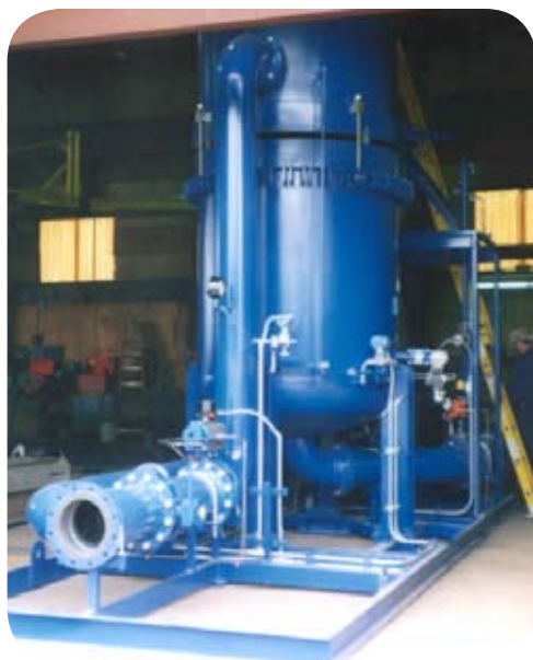
1000 ft 2 backwash filter skid

eNPure Tubular Pressure Filters utilize metallic or ceramic/metallic filter elements that are regenerated by backwash techniques.